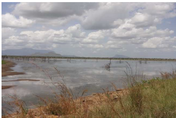
Figure 2. Nakicumet dam in Napak District