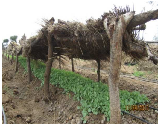
Figure 7. A seed bed of vegetables awaiting transplanting