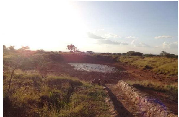
Figure 3. Lomario dam in Rupa, Moroto district