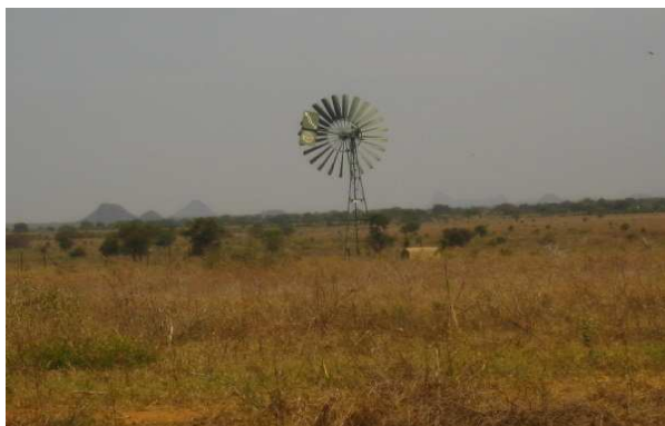
Figure 1. Lotome windmill in Napak District

Six sources of water exist in Karamoja for livestock depending on season and type of livestock. Boreholes, wind mills (Figure 1) and ponds fall in the first category of water sources utilized mainly to water small stock (goats, sheep and donkeys) mainly by small herders. Goats and sheep watered in these facilities are mainly those that remain within the manayattas. Valley tanks, dams (Figure 2 and 3) and rivers (Figure 4) and river beds provide the second category of water sources for livestock in Karamoja (Plates 1-4). Rivers are mainly utilized during rains while during desperate periods, river bed sand dugout wells are utilized to water livestock in the major rivers. Dams have proven to be useful sources of water for livestock; in Moroto and Napak; Kobebe and Nakicumet dams respectively have proven most important dams. Since their construction, these dams have barely dried. They have thus become convergence points for livestock when the water scarcity problem intensifies in the surrounding districts. Kobebe dam for example hosts the Matheniko and some Tepeth pastoral communities from Rupa sub-county and slopes of mountain Moroto respectively located in Moroto District, Jie pastoral community from Kotido District and Turkana pastoralists from Kenya while Nakicumet dam provides for the Bokora and the Pian pastoral communities from Napak and Nakapiripiriti (particularly those from around Lorengdwat and Nabilatuk sub-counties) respectively.