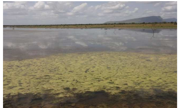
Figure 9. A greeny water weed blooming in Nakicumet dam