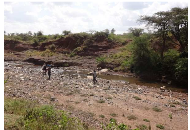
Figure 4. River Moroto as seen from Moroto district