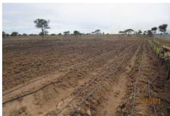
Figure 6. Prepared gardens laid with drip irrigation pipes at Nakicumet