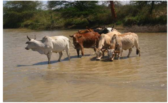
Figure 8. Direct watering of livestock in Lomogol dam in Kotido District