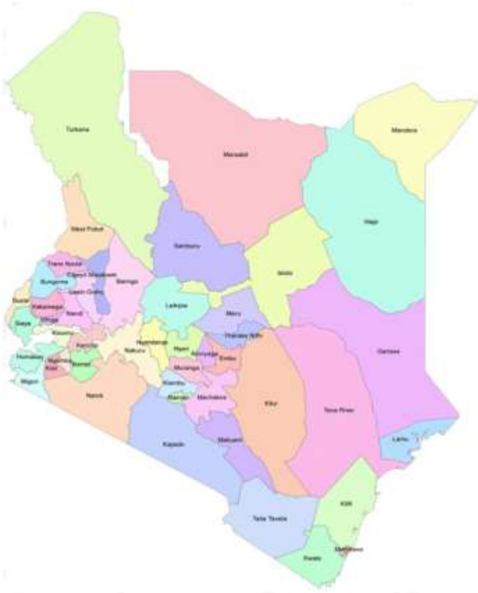
Map 1: Counties of Kenya

Whereas the core mandates of the county government units are in what is conventionally labelled as 'development' functions, devolution is set to transform all governance process. Indeed, devolution is not a mere sharing of tasks between the national and county governments but runs through the entire process of governance and governmental decision-making and policy implementation. This means that even those mandates that may be considered national government mandates, such as security, devolution and the devolved system of governance will structure the way in which they are conceived and delivered.